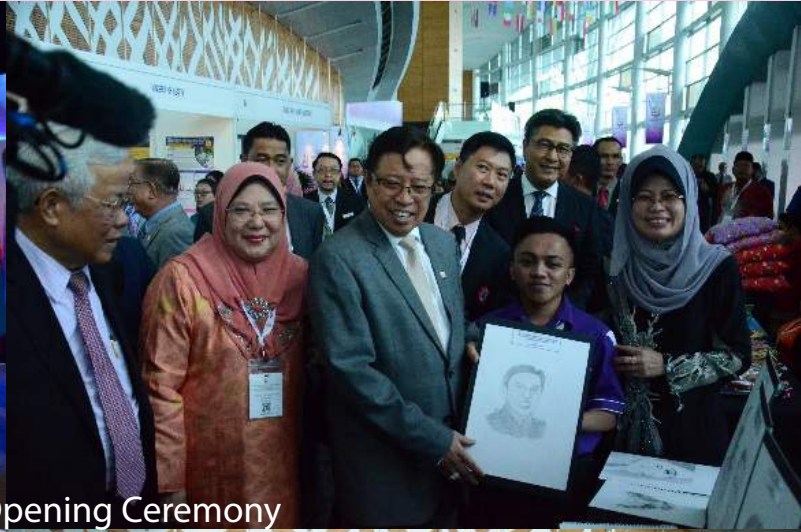
2nd ICSE 2017 Opening Ceremony