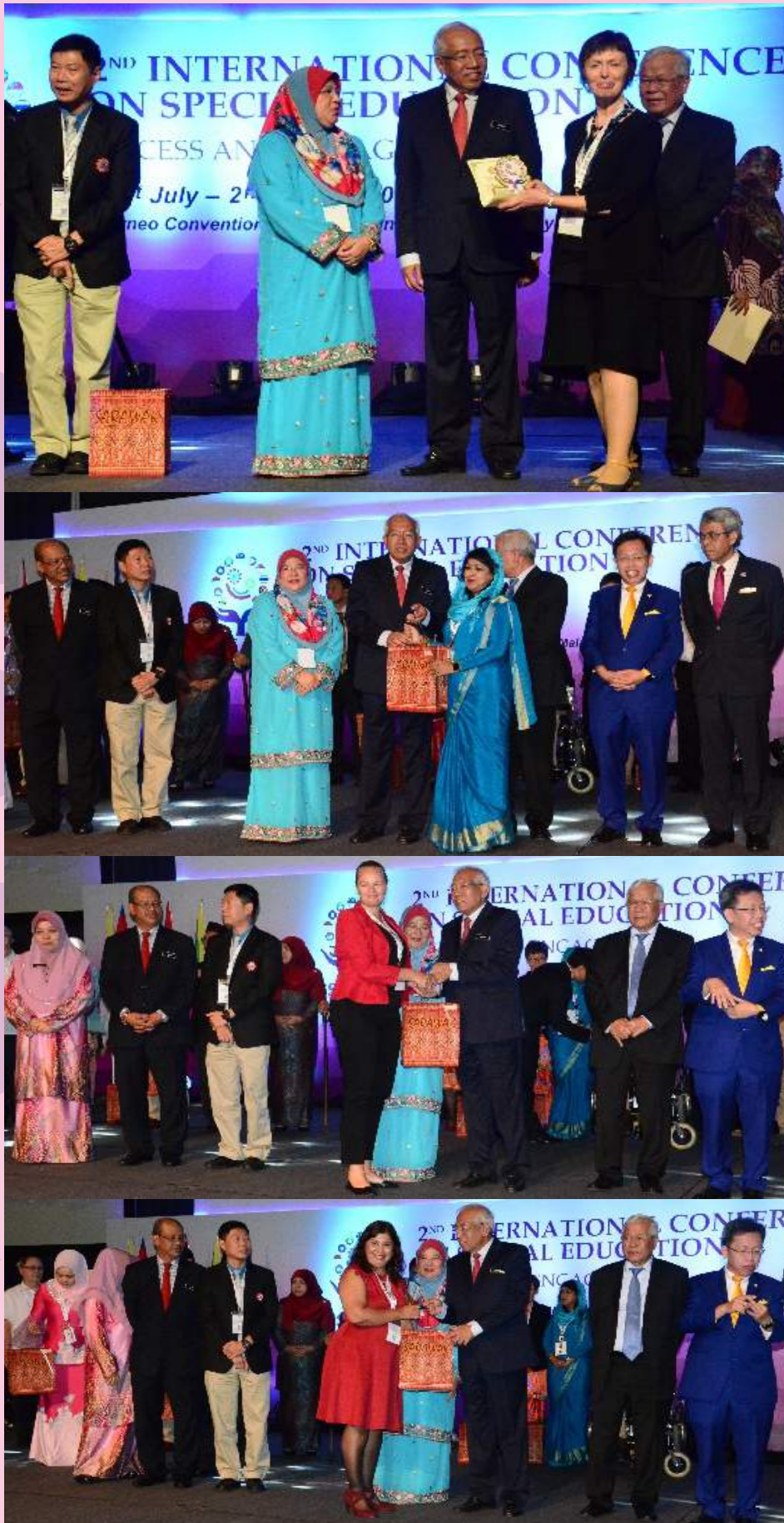
Presentation of memento to 2nd ICSE 2017 Speakers