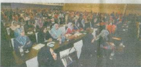
Participants consisting of educators and field experts from around the world at the conference.

"The Malaysian Education Blueprint 2013-2025 has addressed the concerns of aspirations for Malaysian Education System that are accompanied by access, quality, equity, unity and efficiency."